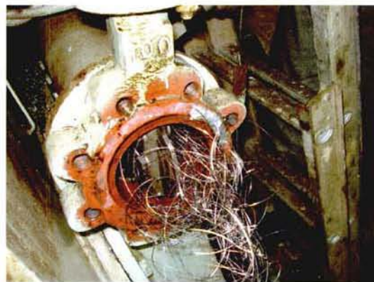
Wrapped-off notch wire in engine lube oil pipe system

HEAD OFFICE (& postal address) MAN Diesel A/S Teglholmegade 41 2450 Copenhagen SV Denmark Phone: +45 33 85 11 00 Fax: +45 33 85 10 30 manbw@dk.manbw.com www.manbw.com